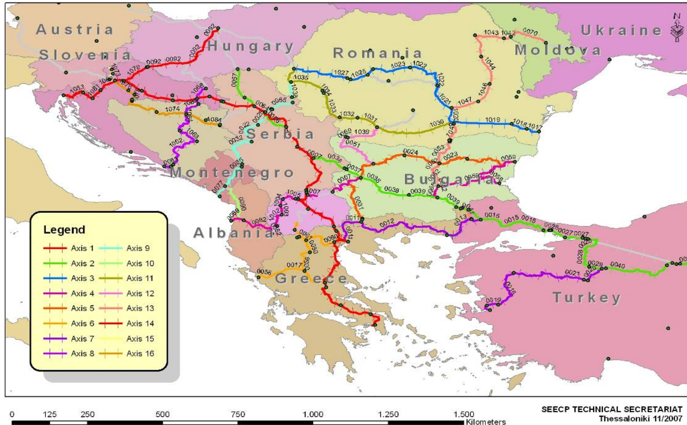
SEECP NETWORK - TECHNICAL SECRETARIAT